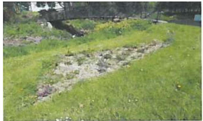
Fig. 2 Pollinator Beds inside Swords Town Park