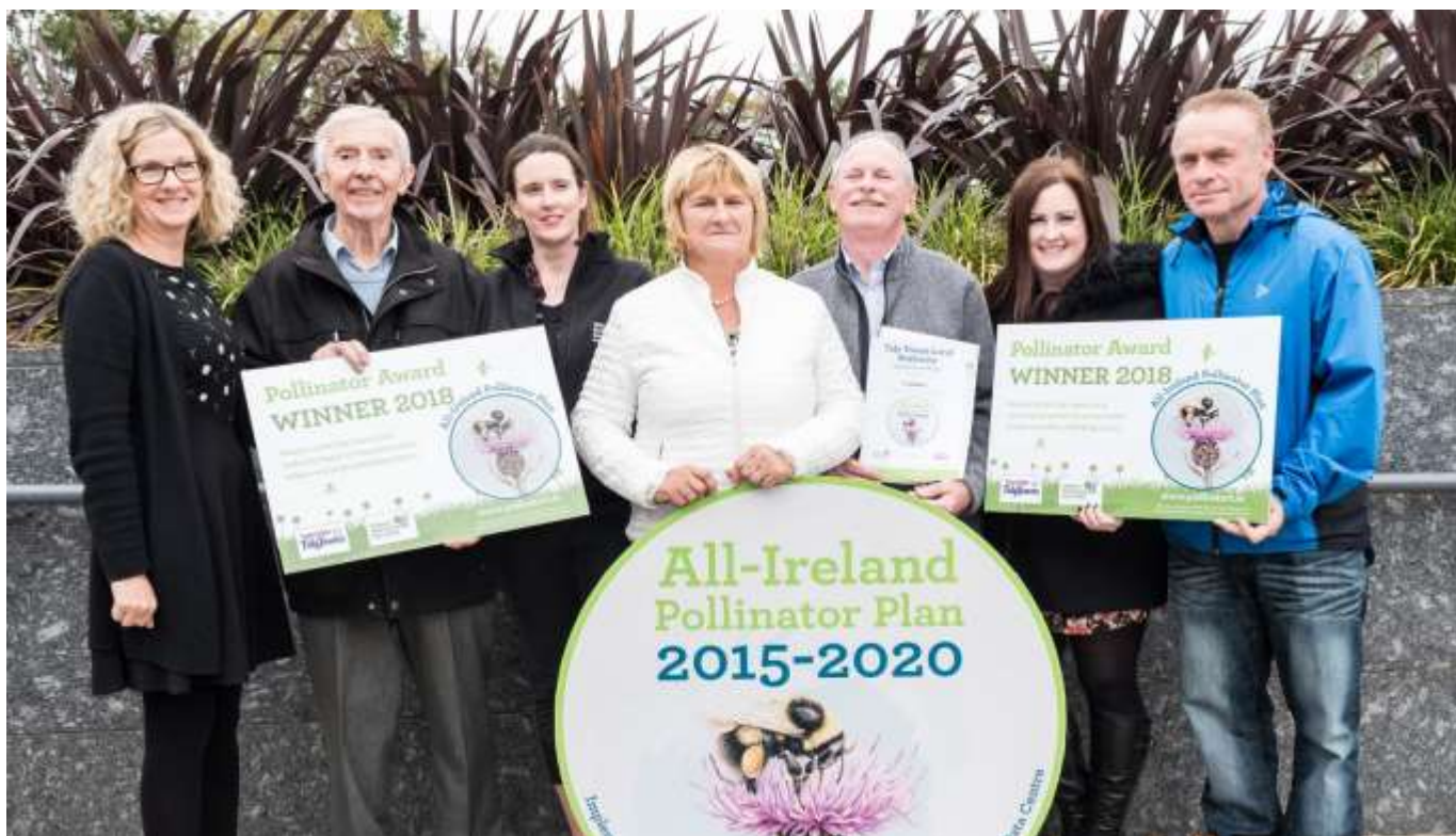
Clonmel Tidy Towns group accepting the Local Authority Pollinator Award 2018 from Heritage Officers and National Biodiversity Data Centre staff at the Tidy Towns awards ceremony at the Helix.

In 2016, when the Local Authority Heritage Officer and Biodiversity Officer Network offered to establish and fund the special Pollinator Award in the national Tidy Towns competition, the team behind the All-Ireland Pollinator Plan were delighted to support this new way to create awareness of pollinators and increase pollinator-friendly habitats right across the country.