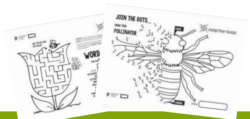
Pollinator activity sheets created by Ennis Tidy Towns