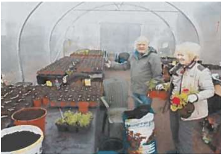
Fig. 8 Plug Plants at our Polytunnel