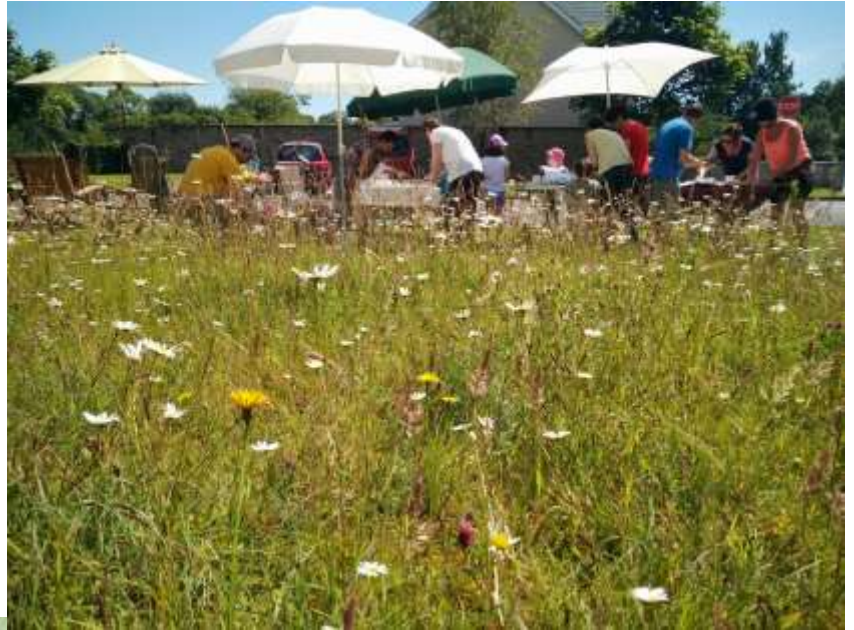
A community event at a local estate showed off the wildflowers that have emerged as a result of reduced mowing.

The promotion of community orchards by the Garden of Eden Project was also linked with pollinators, as was the planting of willow by a local estate in the town. We posted regular colour photos of our pollinator roundabouts, including the emergence of orchids in some areas, which have only become visible since the cutting regime has been changed. We feel that by providing these examples and connecting people with their sense of place that small achievable actions will be delivered throughout the community. This is a great starting point in the protection and improvement of biodiversity in general, as well as pollinators.