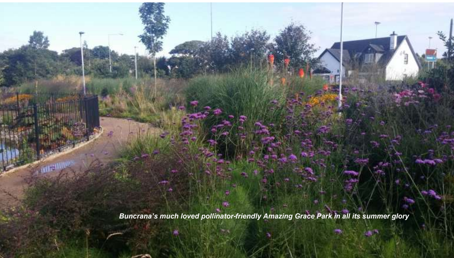
Buncrana's much loved pollinator-friendly Amazing Grace Park in all its summer glory

Another great collaborative project we work on each year in the all-island 'One Million Trees in One Day' initiative. We work with a great wildlife group, Wild Inishowen and Inishowen Rivers Trust. During the devastating local floods of August 2017 we lost a significant number of trees along the Crana River. Last year we managed to plant over 1,000 trees at Dunree Fort, Cockhill Cemetery, Gubbins Farm along the Crana River to add protection to the riverbank and nearby Elm Park, again to help protect the riverbank. We planted Holly, which is hugely pollinator friendly. We also planted Hazel, Ash, Birch