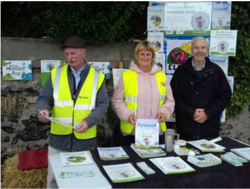
Our Pollinator Stand at Clonmel Applefest Festival in September, where we promoted the Pollinator Plan and received a very positive response .

Our commitment to all of these activities commenced in 2015 when we adopted the Pollinator Plan guidelines and the impetus has grown year on year as we witness the success of our efforts and the positive results. Awareness throughout the community has grown, too, and people are now more aware of how all of the actions outlined above are so important in relieving the plight of our friends, the pollinating insects. We hope that this attitude persists and that the strategy will continue to reap positive outcome over the coming years.