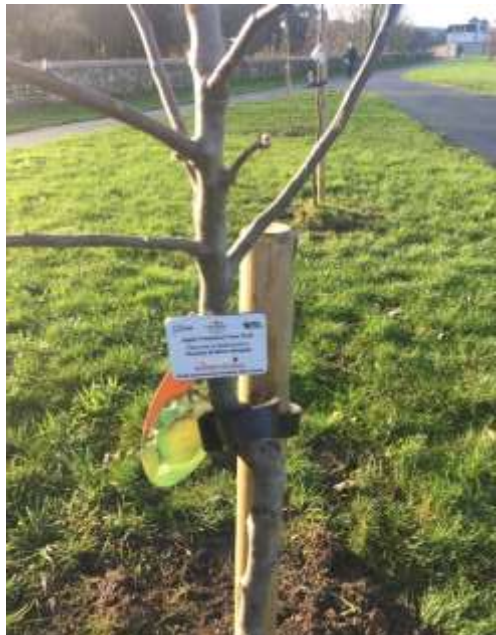
Apple tree planting by Suir Greenway.

They distributed the Pollinator Plan's 'Business guidelines' to local businesses to encourage them to sign up as plan partners, and worked with Clonmel Men's Shed to produce signage to help identify pollinator-friendly sites. Working with the Men's Shed and other Community groups such as SuirCam and