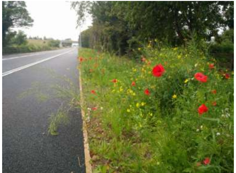
By talking to the local Council when they spotted new roadside clearance, Ennis Tidy Towns managed to have a large tract of verge planted with native wildflower seed.

www.ennistidytowns.com www.facebook.com/ennistidytowns