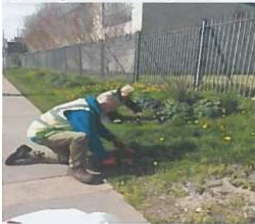
Fig. 1 Grass cutting at Colaiste Choilm