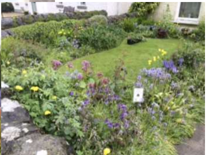
Best Garden for pollinators competition in Geashill