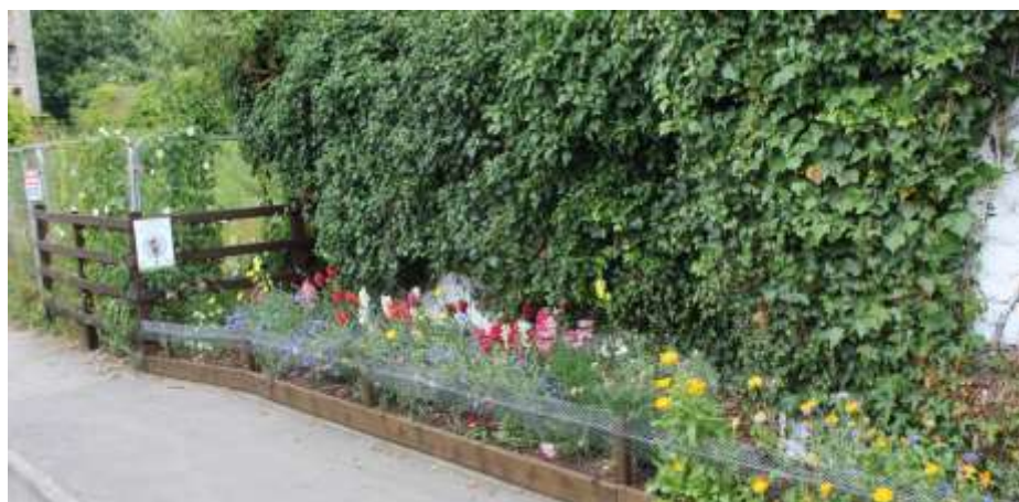
Buncrana Tidy Towns maximise every nook and cranny to provide pollinator-friendly areas across the town

I hope this article gives you a flavour of our Pollinator work and of the partnership approach we have fostered over the years. We are deeply committed to our local environment and wider community. If our bees are plentiful and happy then all is right in our world.