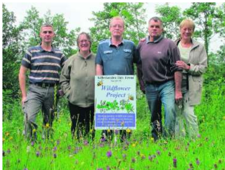
Above: A group of workers from Killeshandra Tidy Towns.