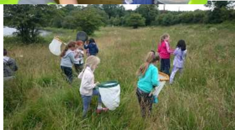
Enjoying a bug hunt at the summer camp at Killeshandra town lake