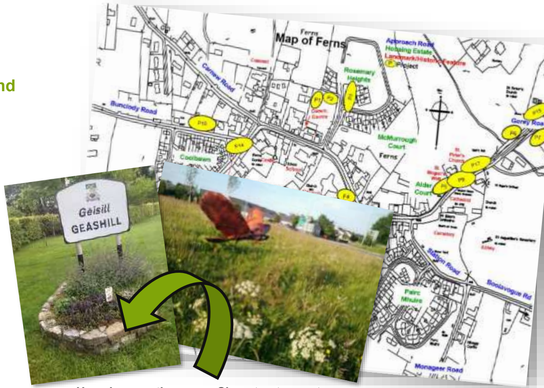
Use clear captions: e.g. Sign at entrance to Geashill village, Plants: Lavender... etc.

By including a marked map of your town or village, and well captioned photographs you will help us to fully understand your pollinator actions.