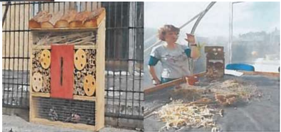
Fig.7 Bee Hotels at Polytunnel