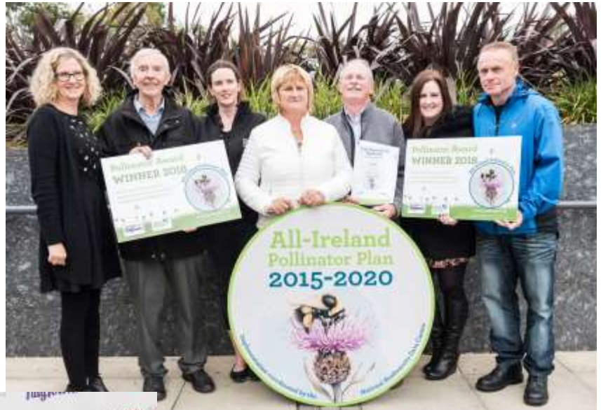
National Pollinator Award winners 2018: Clonmel, Co. Tipperary

The Local Authority Pollinator Award is a special TidyTowns award, sponsored by the Heritage Offices & Biodiversity Offices of Local Authorities across Ireland.