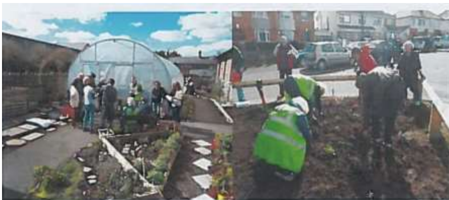
Fig. 9 Pollinator Workshop 1 & 2