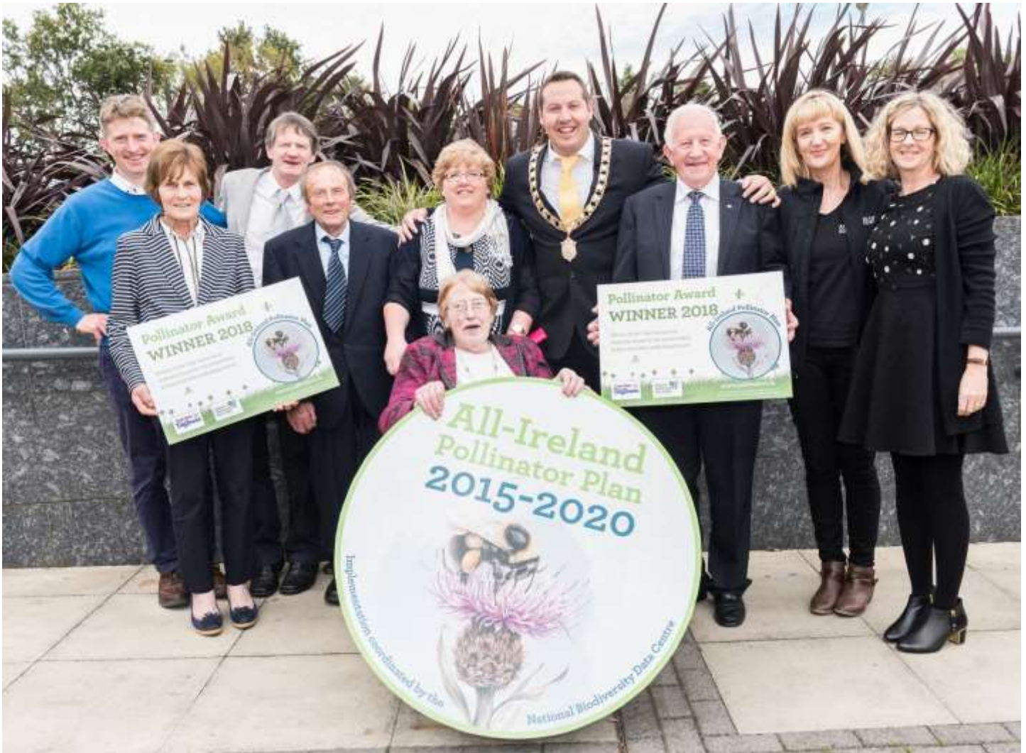
The team from Tullahought celebrating their win!

park, seen here abundant with wild strawberries