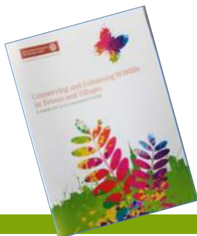
Joint Heritage Officer and Heritage Council guidance for community groups on conserving wildlife in towns and villages (2004).

Heritage and Biodiversity Officers have a long history of working with and supporting the work of Tidy Towns groups, providing advice and information on conserving and enhancing local heritage. This special Pollinator award builds on this relationship.