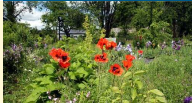
Bellefield House and Gardens, Shinrone, Birr.

2. Body Scan: This technique, involves scanning your body from head to toe and being aware of any discomfort, sensations, or aches that exist (which could be indicators of stress and anxiety). To start bring awareness to your feet observe any pain or sensation-acknowledge it - breath through it and move on to the next part of your body.